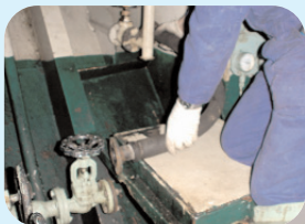
Illegal pipe - sludge pump to overboard