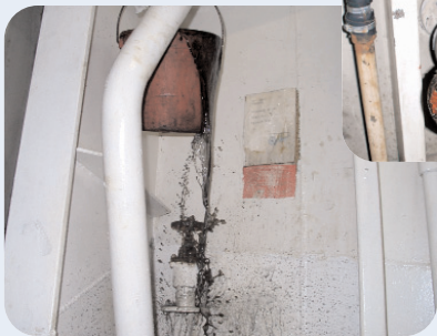
OWS test run